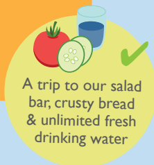
A trip to our salad bar, crusty bread & unlimited fresh drinking water