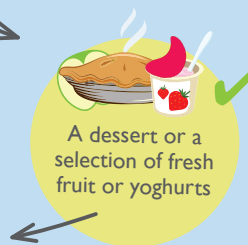
A dessert or a selection of fresh fruit or yoghurts