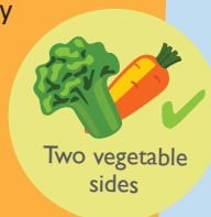
Two vegetable sides